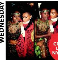
JANELLE MONÁE “#WCW [Woman Crush Wednesday]” —@janellemonae