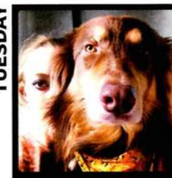
AMANDA SEYFRIED “#Twoforonetuesday”