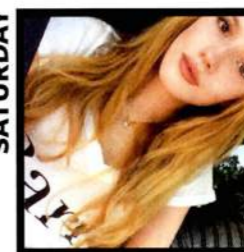
BELLA THORNE “No makeup #SelfieSaturday” —@bellathorne