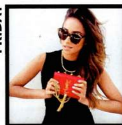
SHAY MITCHELL “#FashionFriday rocking a LBD” —@shaym