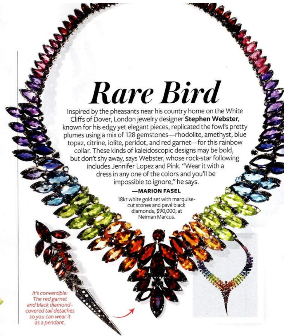
It's convertible: The red garnet and black diamond-covered tail detaches so you can wear it as a pendant.

18kt white gold set with marquise-cut stones and pavé black diamonds, $90,000; at Neiman Marcus.