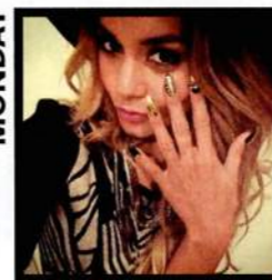
VANESSA HUDGENS “Blinging out my nails #ManiMonday” —@vanessahudgens